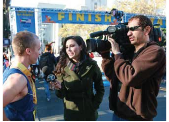
ELITE RUNNERS / MEDIA