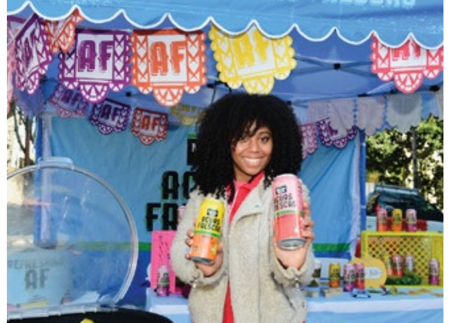
ON SITE ACTIVATIONS