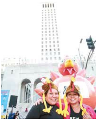
LOS ANGELES CITY HALL