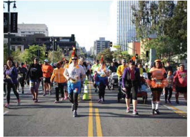
SCENIC COURSE THROUGH DOWNTOWN LA