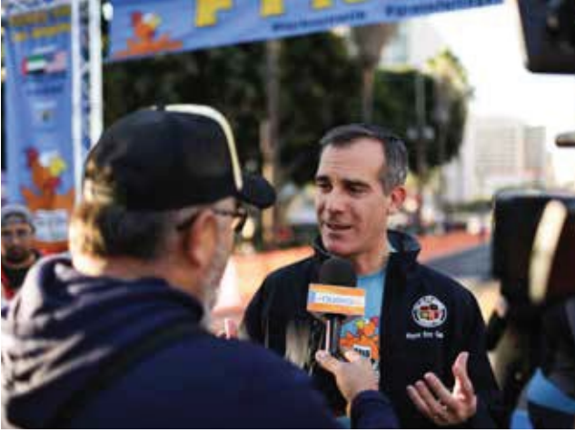
LOS ANGELES MAYOR ERIC GARCETTI