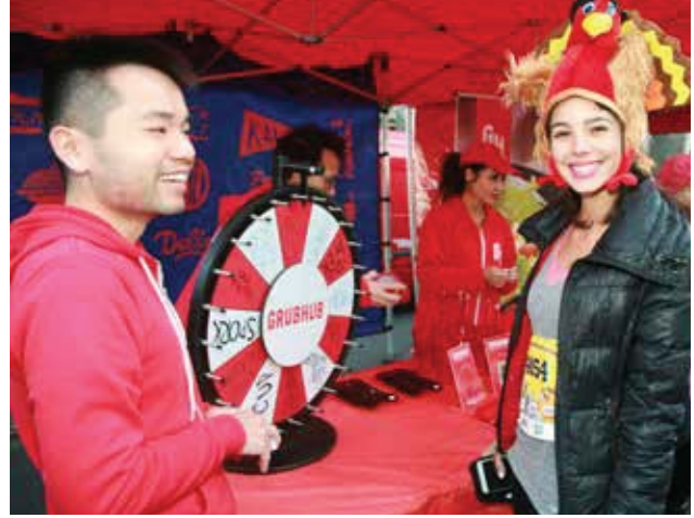
ON SITE ACTIVATIONS