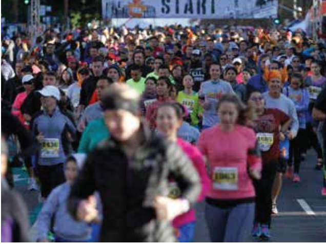
LARGEST TURKEY TROT IN LOS ANGELES