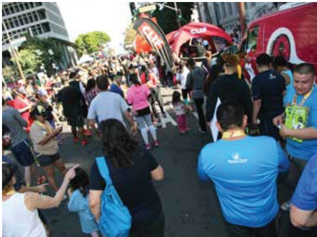
ON SITE ACTIVATIONS AT EVENT FESTIVAL