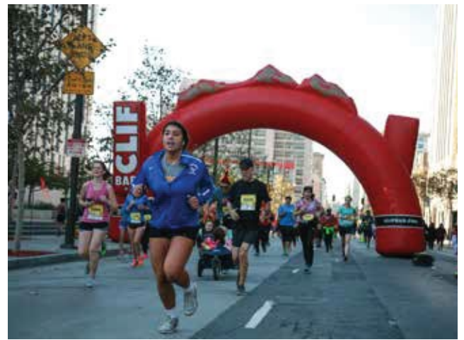
ON COURSE ACTIVATIONS