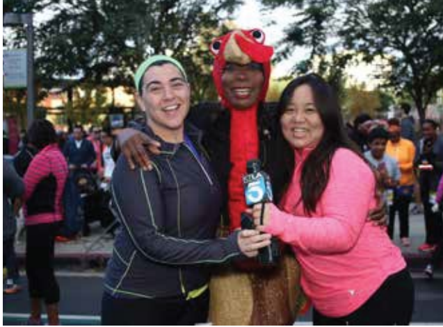
GAYLE ANDERSON - KTLA 5