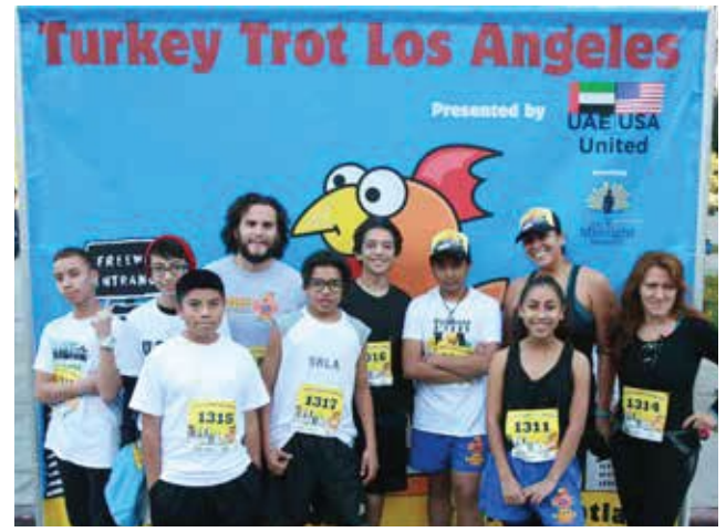
BACKDROPS FOR EVENT INTERACTION