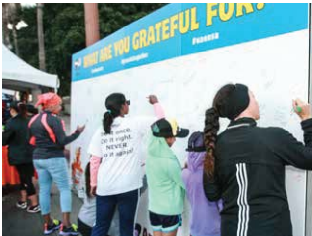
CUSTOMER INTERACTION - GRATEFUL WALL