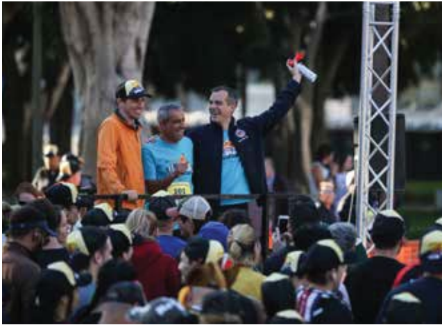
CONSUL GENERAL OF THE UAE AND MAYOR OF LA