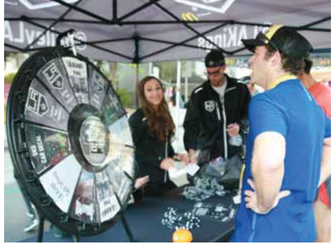
ON SITE ACTIVATIONS