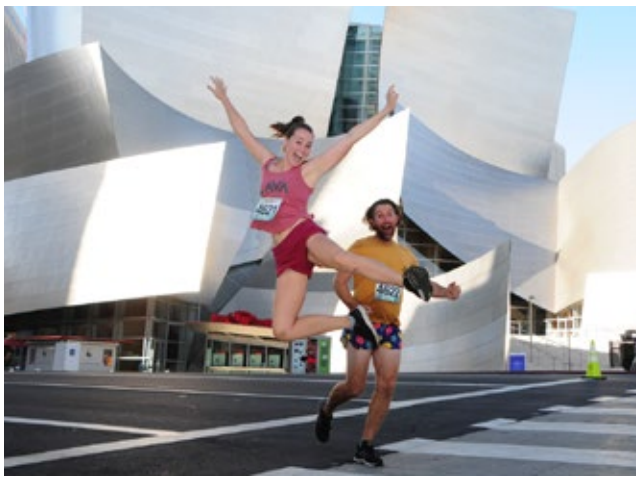
SCENIC COURSE PAST DISNEY CONCERT HALL